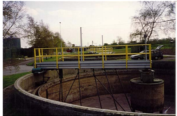
Combined access walkway and rotating filter spray arm