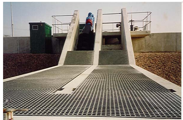
Typical wastewater application