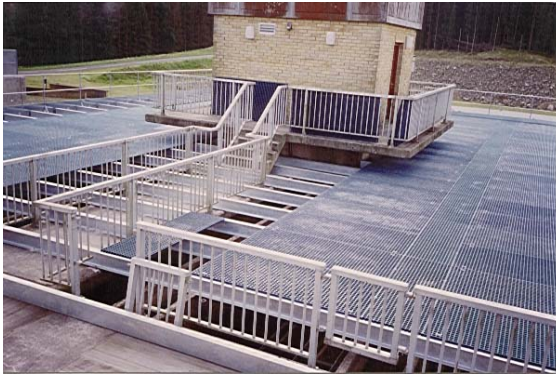
Complete support structures, flooring and handrailing in sturdy GRP

GRP pultruded structural sections have a high strength-to-weight ratio and an outstanding resistance to creep, fatigue, corrosion, and chemical attack. Available in various profiles and in lengths up to 6m - often from stock. They are easy to cut, and easy to manhandle due to low weight, and can be either mechanically affixed using standard conventional fasteners, or epoxy-bonded.