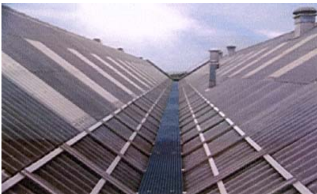
GRP rooftop "catwalk"