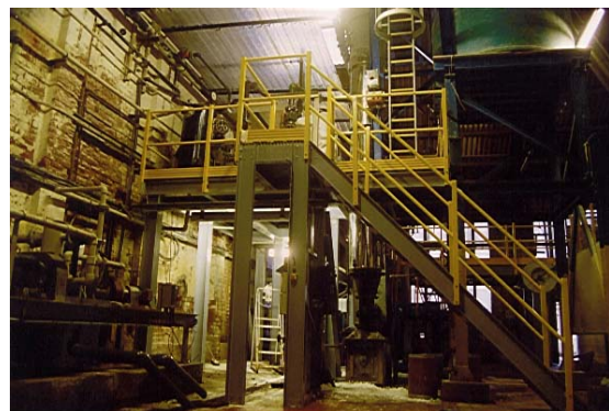
GRP stairway with multi-level mezzanines

The availability and variety of pultruded GRP structural sections, enables the design and fabrication of large and surprisingly complex building structures to be completed quickly and economically. From a simple stairway or mezzanine floor, to a total multi-level walkway and access platform network!