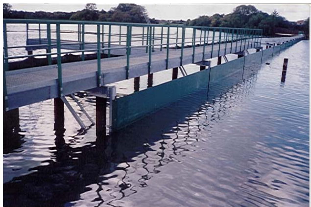
GRP Walkway and Handrailing, with moulded Baffle Boards for reservoir installation

GRP materials offer total corrosion resistance and long term reliability. Maintenance requirements are virtually eliminated as GRP never needs painting!